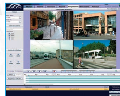
Real-time and non-real time video operation